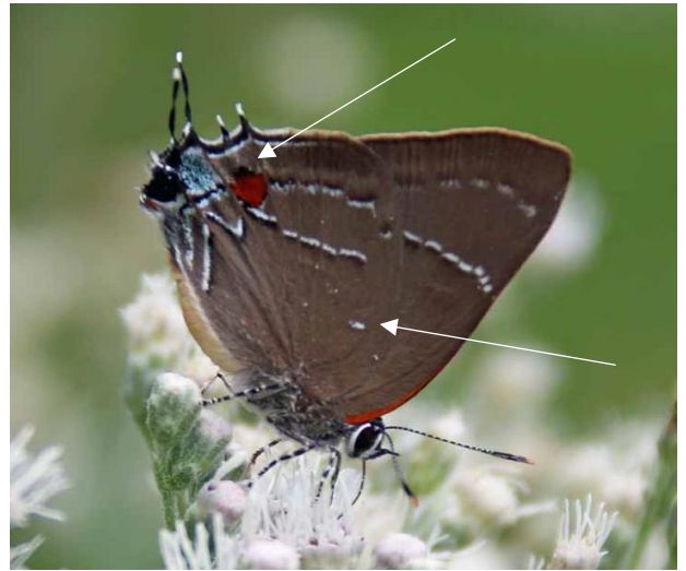
White M Hairstreak

White spot at center of top edge of HW Red spot set inward of HW edge