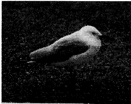
"The Silver Gull was spectacular, it's scarlet legs and feet, and scarlet bill made it stand out"

One of the fascinating things about birding for me is chasing a rare bird, and succeeding. All of us have had our share of failures, whether it's just a failed trip to a local lake to see a migrant we just heard about, or a trip across the county to look for a species we've never seen before. In the end, a lot of it amounts to luck. We can improve our chances by honing our observation skills, and by visiting the right habitat at the right time of year, but for me it seems that to see a bird, I have to be looking for something else.