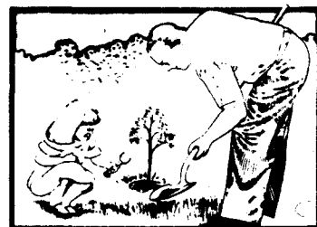
Trees are being planted.