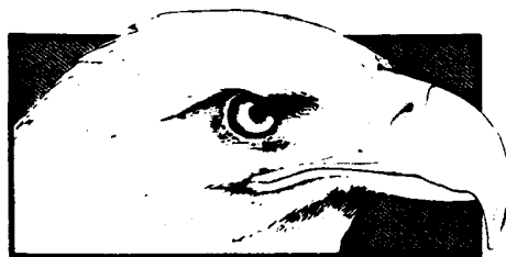
Eagle habitat is being protected.

The MARYLAND Check-off Works. Please Give.