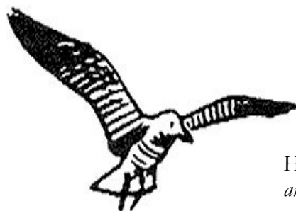
Herring Gull