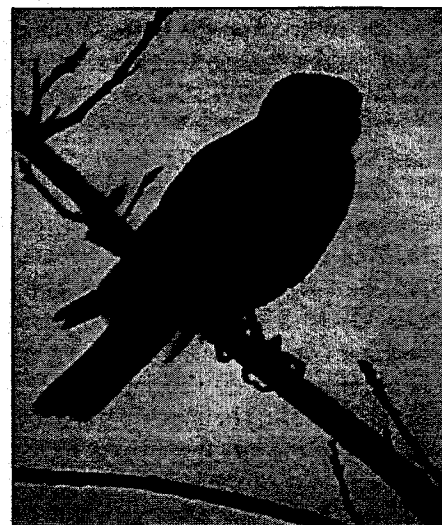
Merlin February 4, 2006.